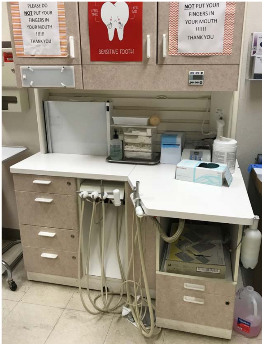
Biotech 12 O'Clock Dental Cabinetry