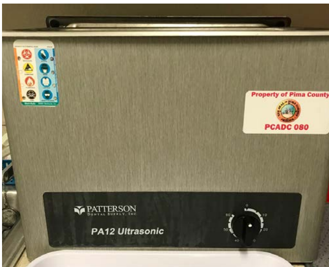
Patterson PA 12 Ultrasonic Cleaner