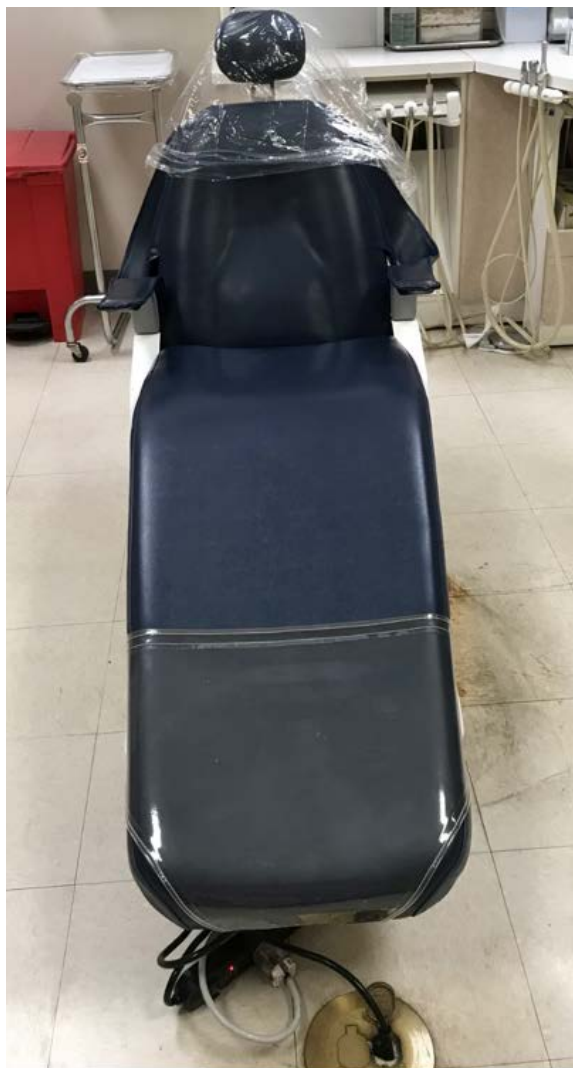
Belmpot Dental Chair