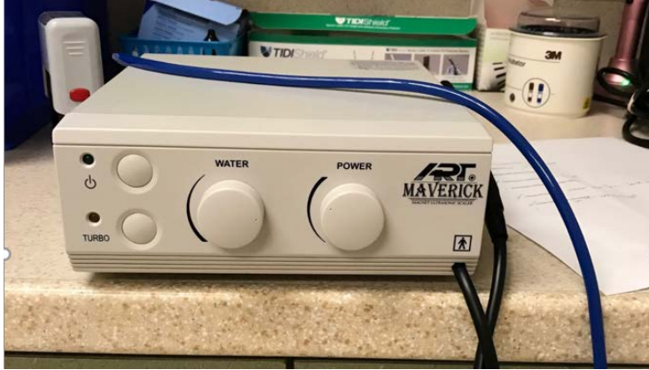
Maverick ART Ultrasonic Scaler Model number ART-M1 (25k)