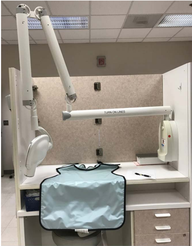
Gendex 765 DC dental x-ray machine – SN 15-1647281DP